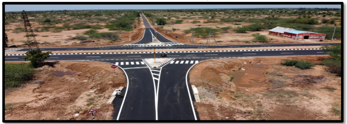
After Road Safety Work 6A