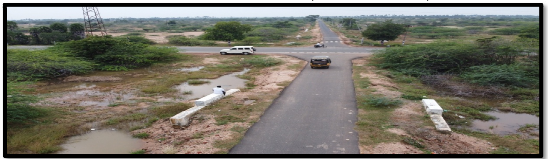
Before Road Safety Work