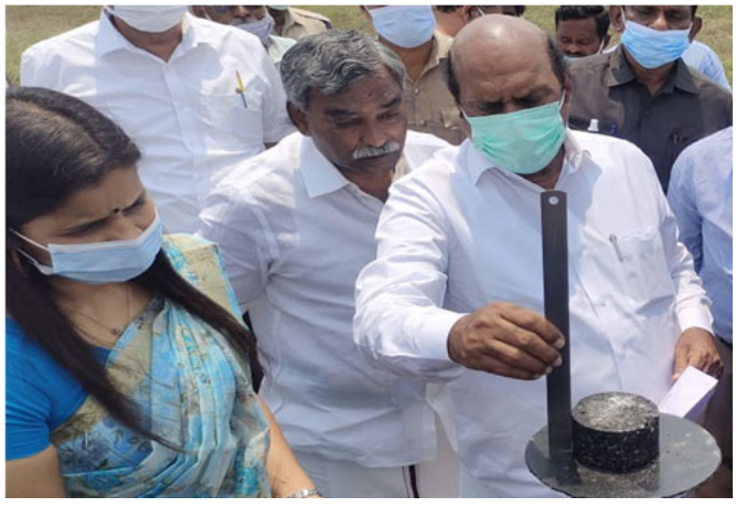
Hon'ble Minister for Public Works, Highways and Minor Ports Department inspected the road work of "Thiruvarur – Kudavasal – Kumbakonam Road" in Thiruvarur district